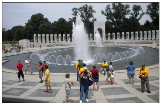
At the World War II Memorial