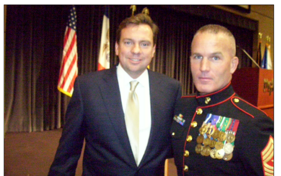
With Brad Kasal, a Navy Cross Recipient