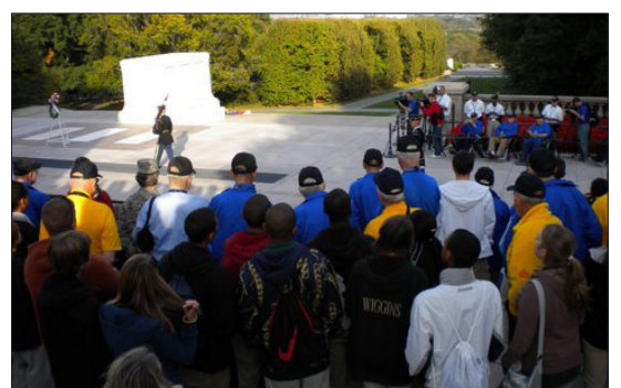
At the Tomb of the Unknown