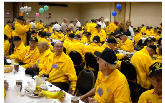
Pre-flight Send Off Breakfast